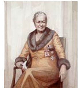
Official portrait of Pauline McGibbon, by Cleeve Horne.