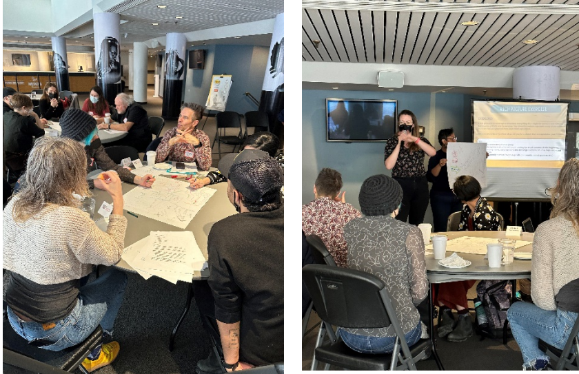
TAPA members engaging in Strategic Planning Town Hall in the lobby of the St. Lawrence Centre for the Arts

Thank you to all of the TAPA members for your continued commitment to TAPA --- we cannot accomplish what we do without your engagement. We fully recognize this is a precarious time in our sector and we are dedicated to listening and learning from all of you.